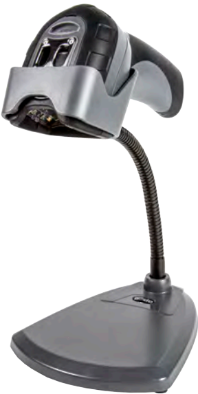
With Optional Stand